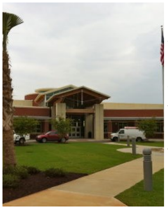
River Bluff High School Front Entrance

The River Bluff High School Band is committed to hosting a first-rate marching band competition. We understand that directors have choices when deciding on where to take their band each week. Therefore, our goal is for our competition to be such a